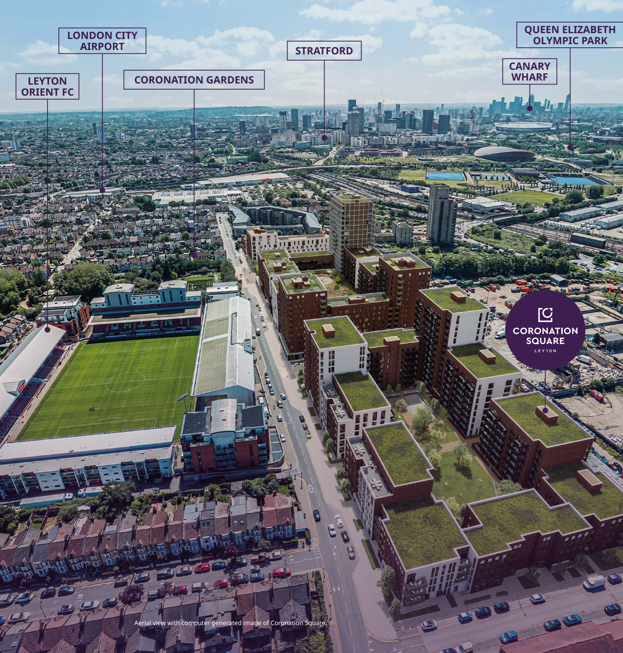
Aerial view with computer generated image of Coronation Square.