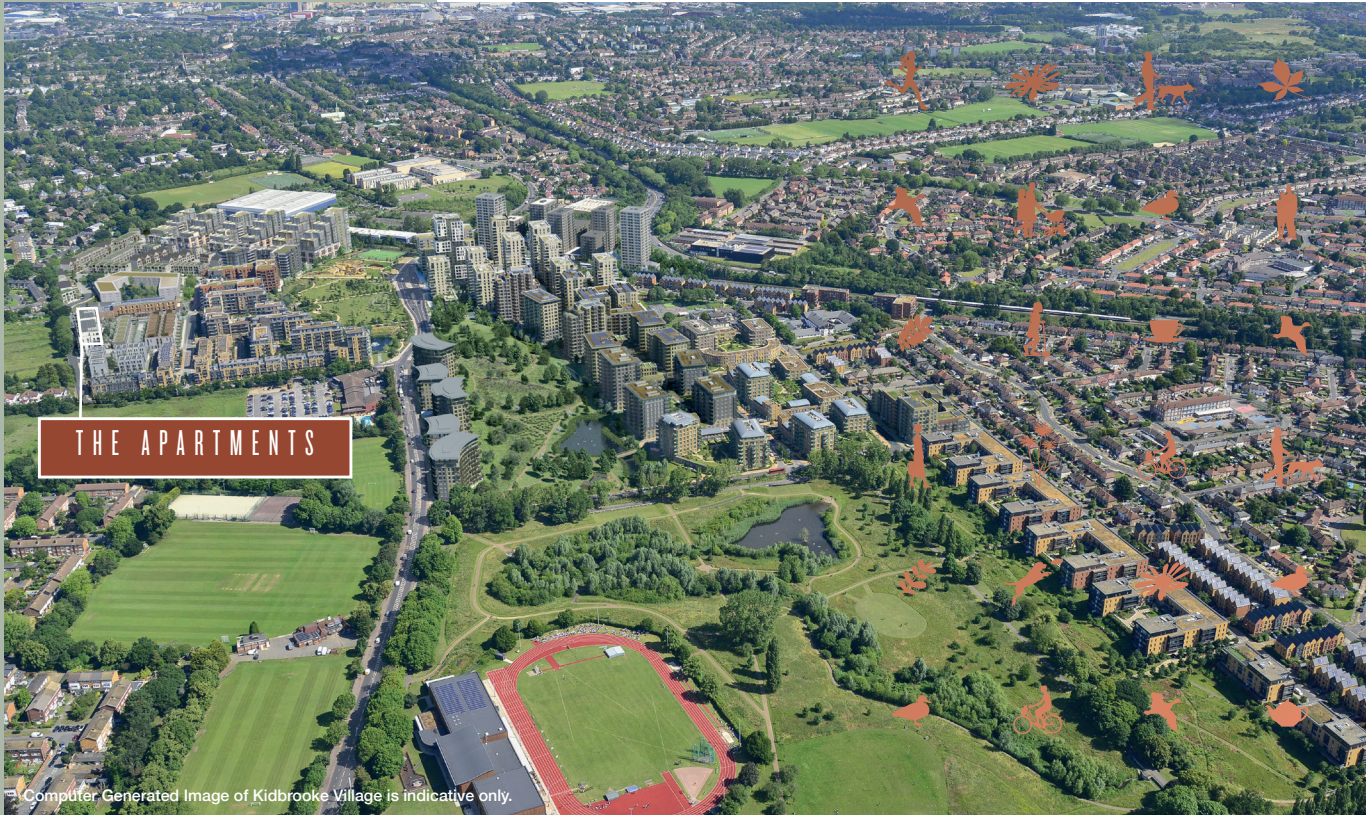
Computer Generated Image of Kidbrooke Village is indicative only.