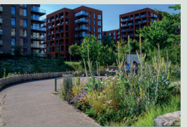
DESIGNED FOR LIFE