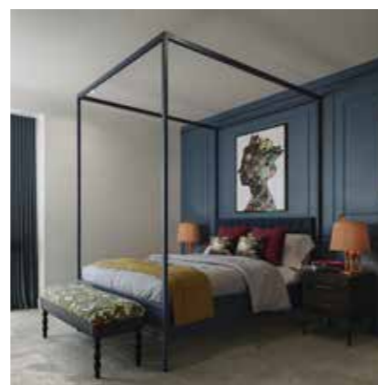
Computer generated images are indicative only.