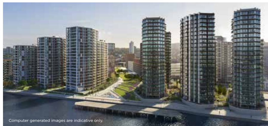
Computer generated images are indicative only.